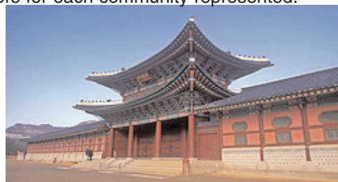
Gyeongbok Palace - Seoul Korea